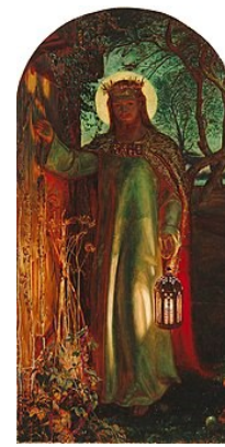
The light of the world.

A famous painting by English artist Holman Hunt (1827–1910)