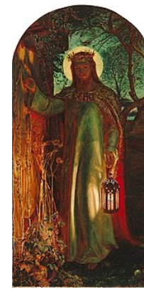
The light of the world.

A famous painting by English artist Holman Hunt (1827–1910)